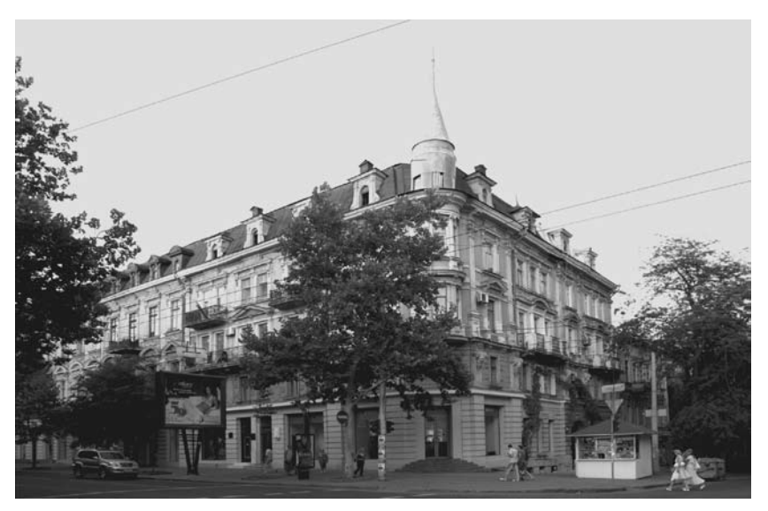
FIGURE 1. The Babel family apartment in Odessa (the top floor above the billboard) at the corner of Rishelievskaya and Zhukovskogo, where Babel resided in 1906–1911 and, on and off, in 1919–1924.