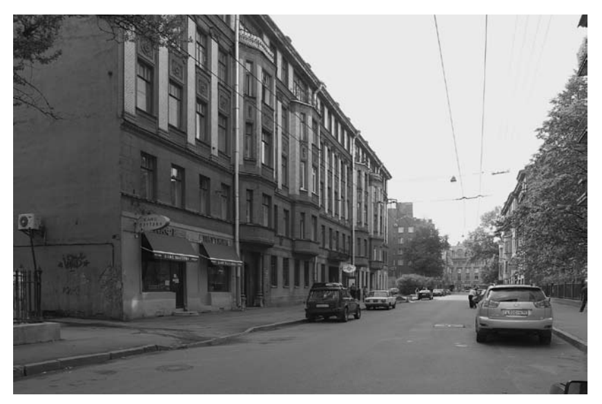
FIGURE 2. The building on the left is 9 Bolshaia Monetnaia Street in St. Petersburg that housed the apartment of Lev and Anna Slonim where Babel rented a room in 1916–1917. Gorky's apartment and the offices of Letopis , where Babel's stories were published in 1916, was at 23 Bolshaia Monetnaia.