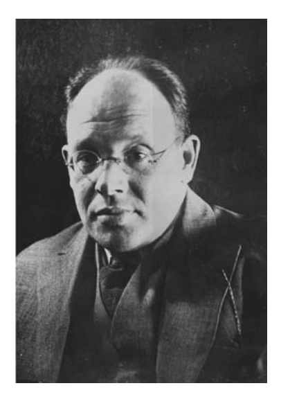
FIGURE 6. Isaac Babel (circa 1935?).